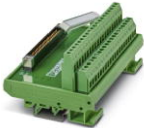
VARIOFACE module for Fujitsu FCN 40

Please be informed that the data shown in this PDF Document is generated from our Online Catalog. Please find the complete data in the user's documentation. Our General Terms of Use for Downloads are valid ( http://phoenixcontact.com/download )