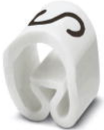
Conductor marking collar, labeled with the capital letter: Letters, white, width: 3.2 mm

Please be informed that the data shown in this PDF Document is generated from our Online Catalog. Please find the complete data in the user's documentation. Our General Terms of Use for Downloads are valid ( http://phoenixcontact.com/download )