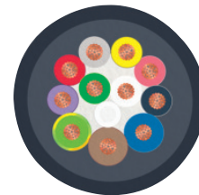
PUR/PVC black [PUR]