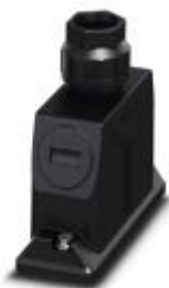
HEAVYCON ADVANCE B24 sleeve housing, with screw locking (Allen screw), plastic, height: 100 mm, with 1 x M40 thread, straight cable outlet

Please be informed that the data shown in this PDF Document is generated from our Online Catalog. Please find the complete data in the user's documentation. Our General Terms of Use for Downloads are valid ( http://phoenixcontact.com/download )