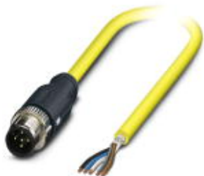
Sensor/Actuator cable, 5-position, PVC, yellow RAL 1021, shielded, Plug straight M12 SPEEDCON, A-coded, on free cable end, Cable length: 2 m

Please be informed that the data shown in this PDF Document is generated from our Online Catalog. Please find the complete data in the user's documentation. Our General Terms of Use for Downloads are valid ( http://phoenixcontact.com/download )