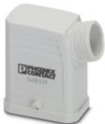
Sleeve housing for single locking engagement nose, lateral cable outlet, for HC-COM-K-KV-PG16 screw connections...

Please be informed that the data shown in this PDF Document is generated from our Online Catalog. Please find the complete data in the user's documentation. Our General Terms of Use for Downloads are valid ( http://phoenixcontact.com/download )