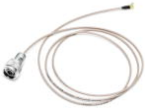
Adapter cable, pigtail 120 cm 90° MCX(m) -> N(m)

Please be informed that the data shown in this PDF Document is generated from our Online Catalog. Please find the complete data in the user's documentation. Our General Terms of Use for Downloads are valid ( http://phoenixcontact.com/download )