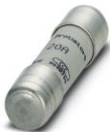
Safety fuse inserts 10 x 38, 20 A.

Please be informed that the data shown in this PDF Document is generated from our Online Catalog. Please find the complete data in the user's documentation. Our General Terms of Use for Downloads are valid ( http://phoenixcontact.com/download )