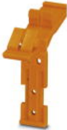
Latching, Number of positions: 2, Color: orange

Please be informed that the data shown in this PDF Document is generated from our Online Catalog. Please find the complete data in the user's documentation. Our General Terms of Use for Downloads are valid ( http://phoenixcontact.com/download )