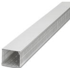
Cable duct, white, comprising upper part and mounting base, width: 25 mm, height: 40 mm, length: 2000 mm

Please be informed that the data shown in this PDF Document is generated from our Online Catalog. Please find the complete data in the user's documentation. Our General Terms of Use for Downloads are valid ( http://phoenixcontact.com/download )