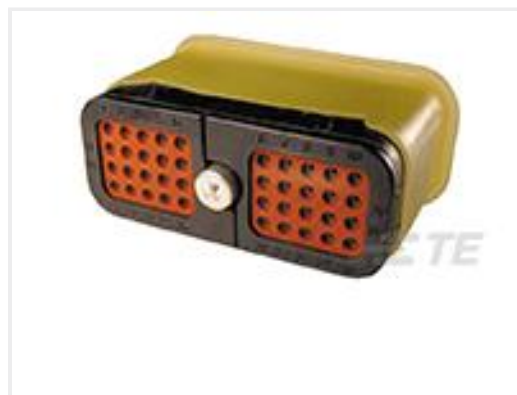
TE Part #DRC26-40SB PLG, 40P, BLK, B