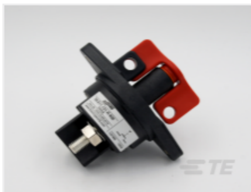
TE Part #K1128729 Battery Disconnecter 35-314-131-S-901