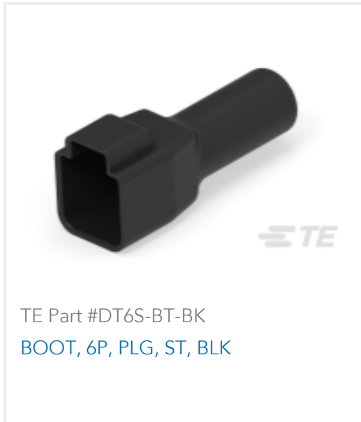
TE Part #DT6S-BT-BK BOOT, 6P, PLG, ST, BLK