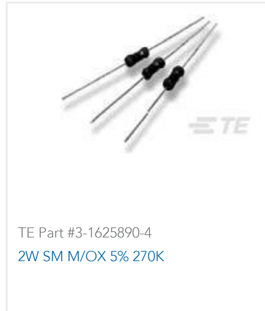
TE Part #3-1625890-4 2W SM M/OX 5% 270K