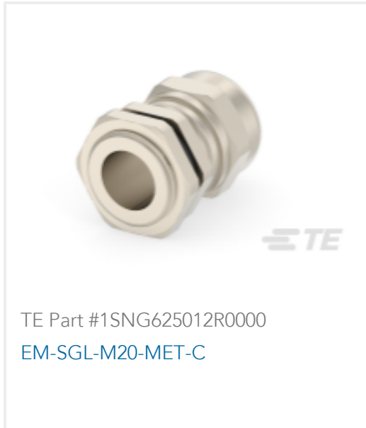
TE Part #1SNG625012R0000 EM-SGL-M20-MET-C