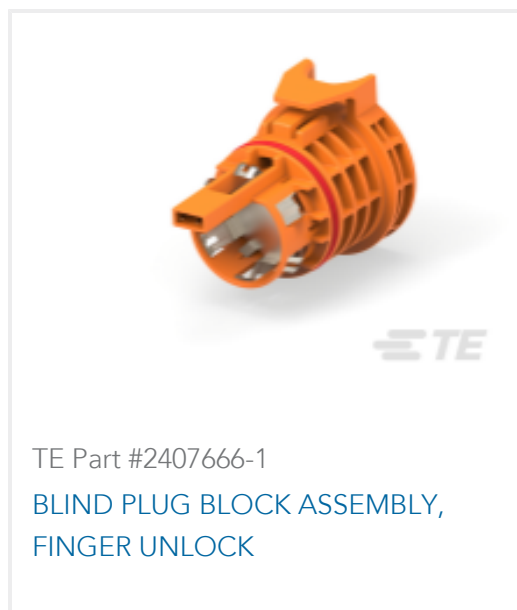
TE Part #2407666-1 BLIND PLUG BLOCK ASSEMBLY, FINGER UNLOCK