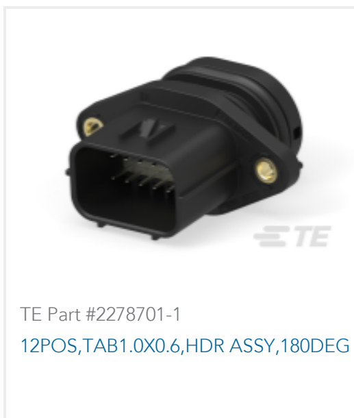
TE Part #2278701-1 12POS,TAB1.0X0.6,HDR ASSY,180DEG