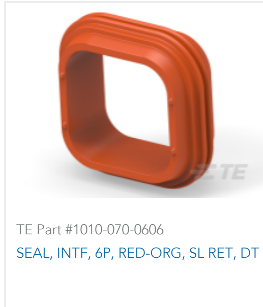
TE Part #1010-070-0606 SEAL, INTF, 6P, RED-ORG, SL RET, DT