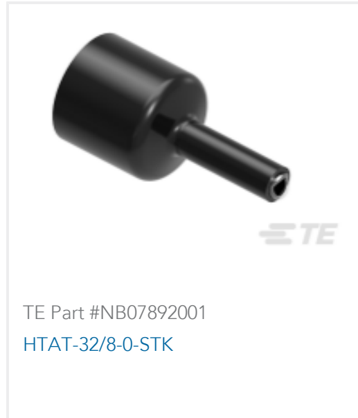
TE Part #NB07892001 HTAT-32/8-0-STK