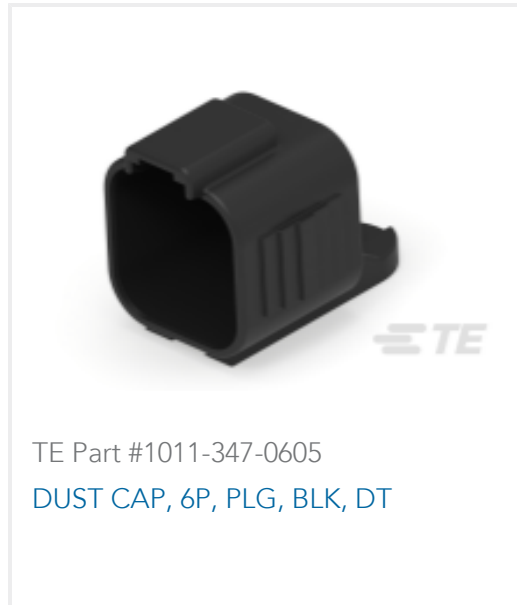
TE Part #1011-347-0605 DUST CAP, 6P, PLG, BLK, DT