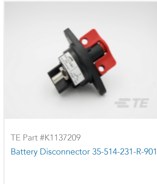
TE Part #K1137209 Battery Disconnect 35-514-231-R-901