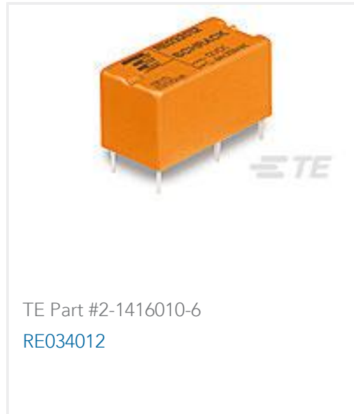
TE Part #2-1416010-6 RE034012